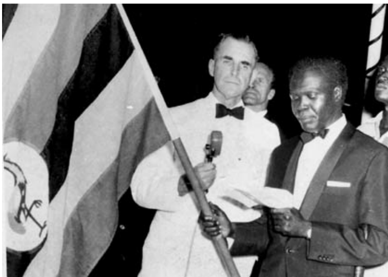
President Yoweri Museveni