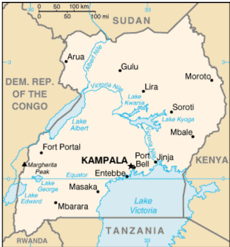
Map of Uganda