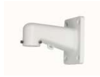
PFB305W Wall Mount