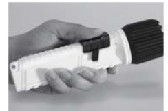
Magnetic Control Switch With Safety Lock