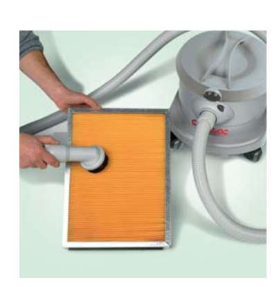
It is important to clean the panel filter with a vacuum cleaner after each cleaning task in order to guarantee perfect machine performance