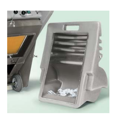
Dirt is conveyed straight into the hopper which is strong and lightweight for easy handling