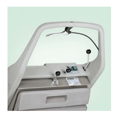
Controls: Suction on/off control, mechanic filter shaker, side brush lifting/lowering mechanism, traction control (on the traction models)