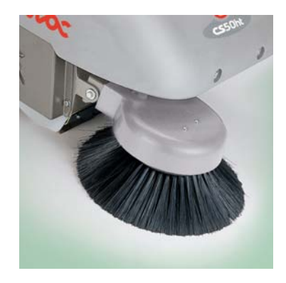
Absolutely vital for cleaning right into corners and along walls. With really dusty floors the brush can be lifted to stop its movement and prevent dust being raised.