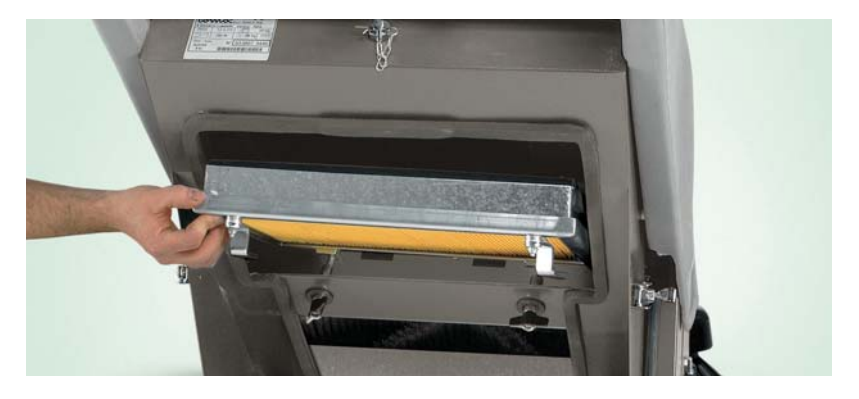
The panel filter can be easily replaced without the help of any tools