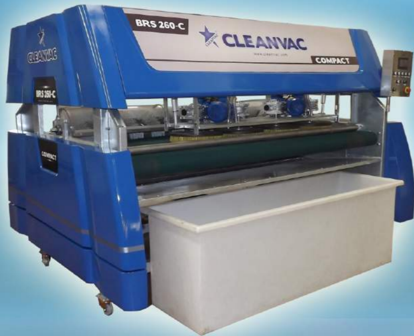
Table type full automatic carpet washing machines for highest capacity carpet and area rug washing needs.

BRS 260 F – BRS 320 F & BRS 420 F models to be offered depending on the maximum carpet sizes to get washed.